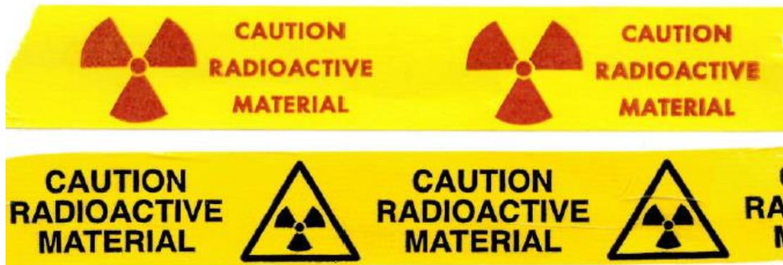
Figure 1: Yellow coloured radioactive marked sealing adhesive tape.

Width: 2.0 - 2.5 cm. Length per roll to be stated in RFQ to estimate Rand cost per metre. See examples below: